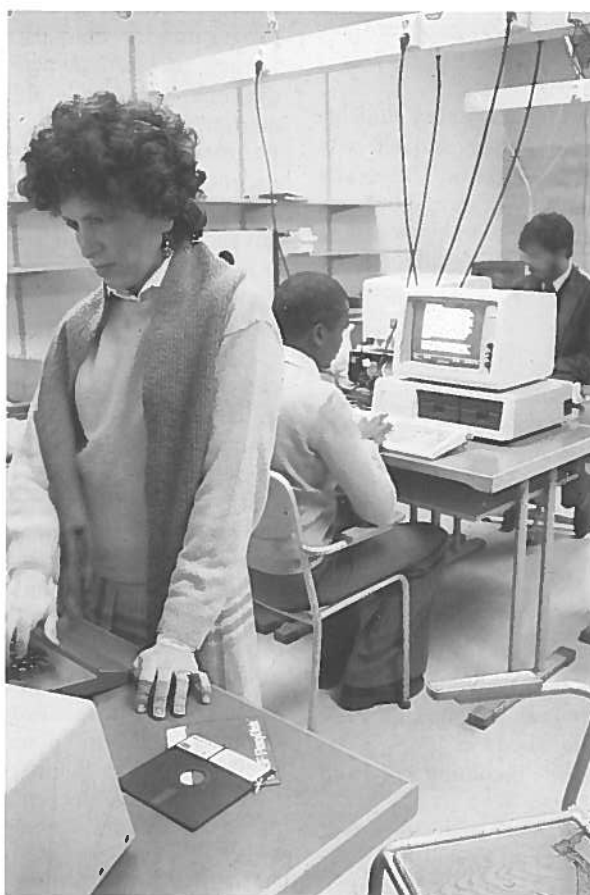
Computer training at WMU is being further upgraded.

I would like to express my gratitude for the splendid assistance provided by the Rector of the World Maritime University in providing the background material on which this article is based.