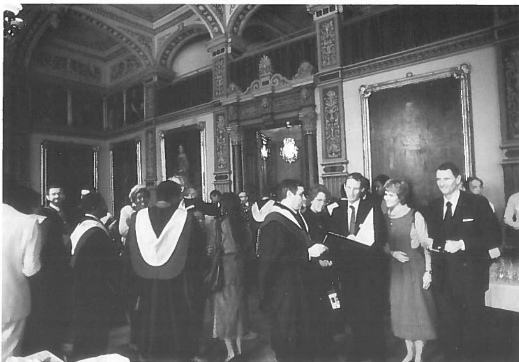
Reception after graduation in the ancient City Hall of Malmö.