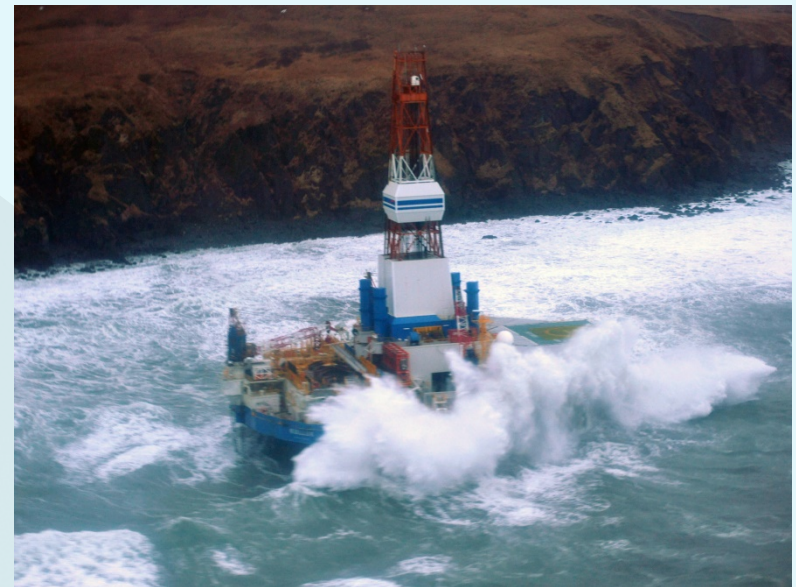
Royal Dutch Shell Kulluk January 1, 2013