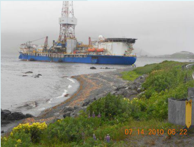
Royal Dutch Shell Noble Discoverer July 14, 2012