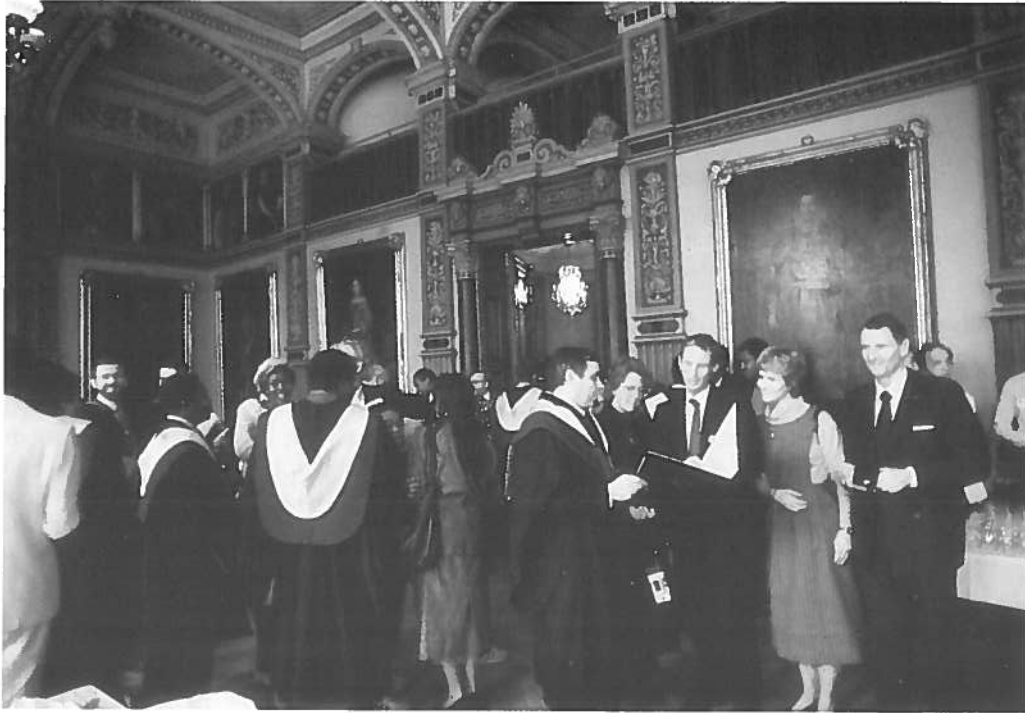
Reception after graduation in the ancient City Hall of Malmö.