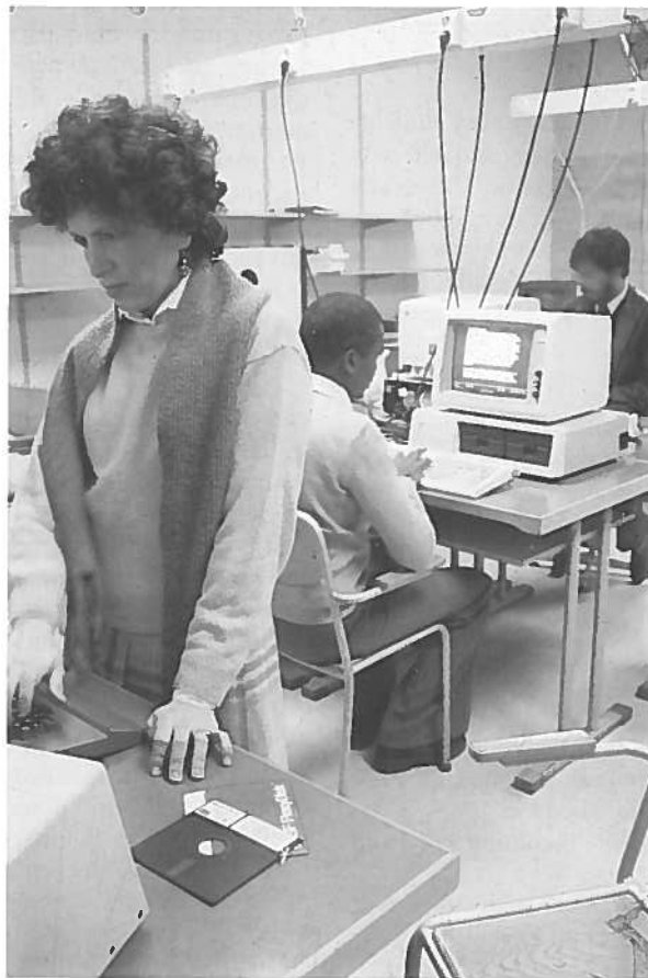
Computer training at WMU is being further upgraded.