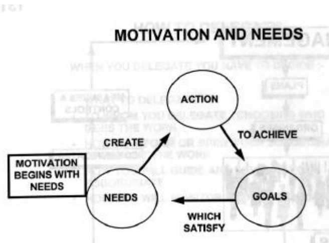
Figure 2 Motivation and needs

persons take or create an action to achieve the goals which satisfy his need at the end. (see Figure 2)